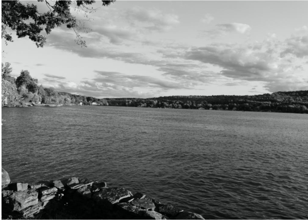
LAKE CAREY AT DUSK AFTER A SPRING STORM